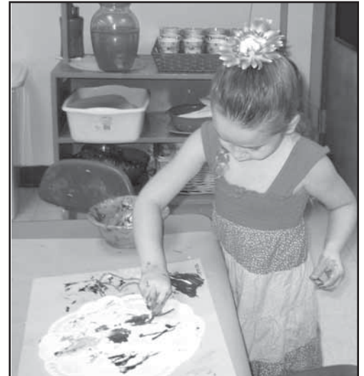
One of our three year olds creating a masterpiece.