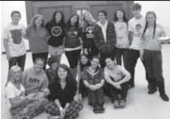
Camp Swift 2011