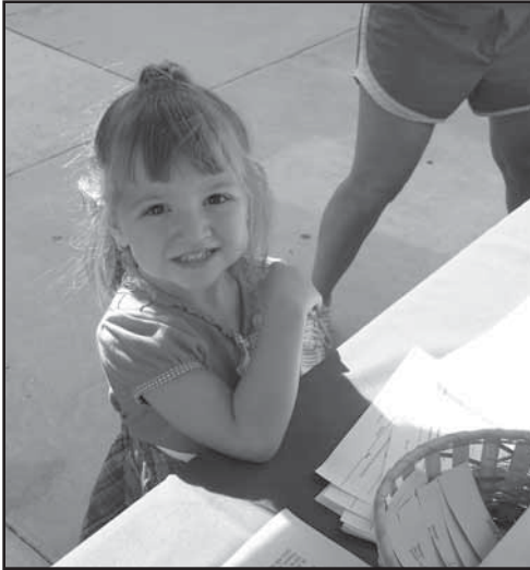
One of our newest children to the ECC, checks in before heading off to her new classroom!

Happy Children, Happy Parents, Happy Teachers... It must be the first day of school!