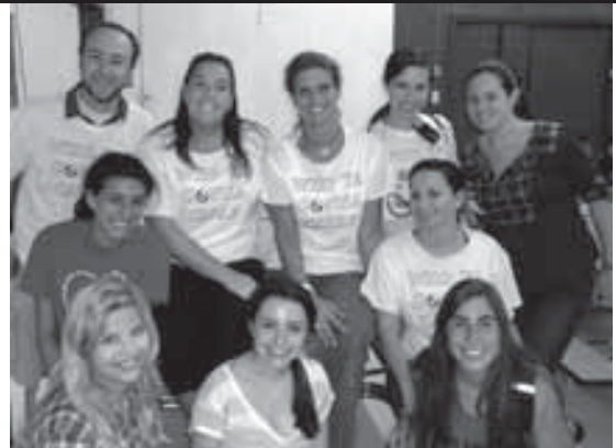
Ed Team and TCTY at Camp Pearlstein